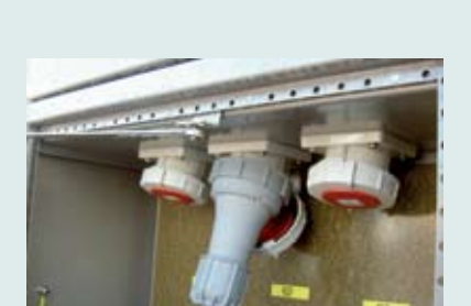
Plug-in energy concepts for electric mobility