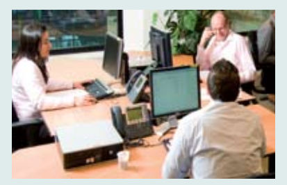
Helpdesk and technical support organisation