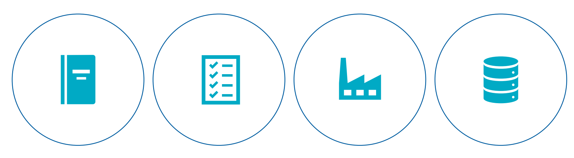
Authentication of identity of applicant